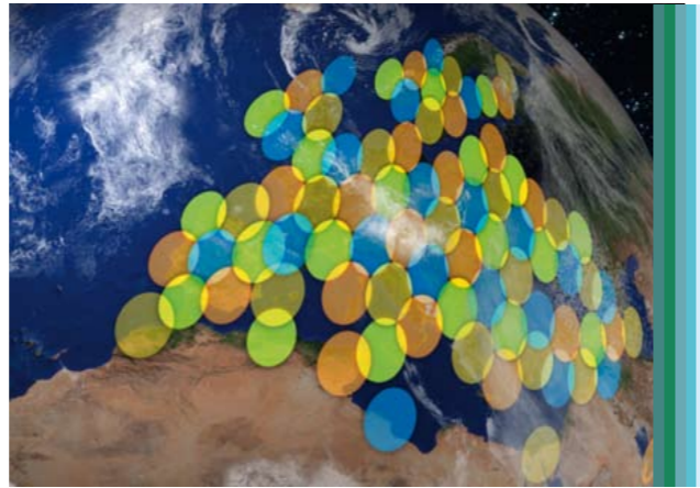
KA-SAT coverage over Europe and the Mediterranean Basin

The sky's the limit with high-speed consumer broadband internet via satellite